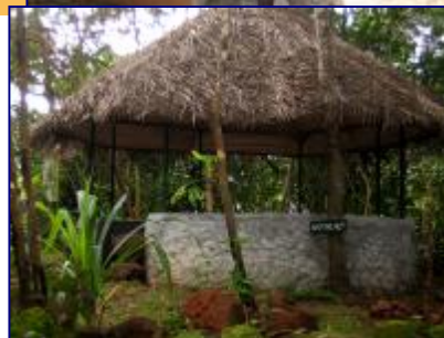
Top: new staff quarters Bottom: waiting hut